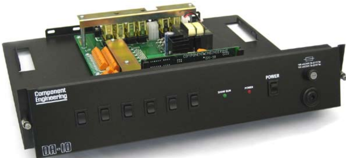
DA-10 Theatre Automation

Contains the familiar and full complement of relays required to control all of your house functions.