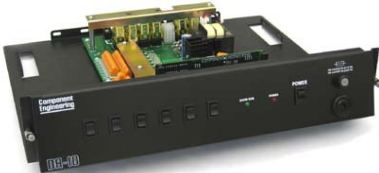
DA-10 Theatre Automation

The DA-10 Theatre Automation is designed for use in conjunction with the Remote Control/Status Indicator Box. With the Remote Control/Status Indicator Box you can control and monitor up to 32 TA-10, TA-10 DX, and DA-10 automations.