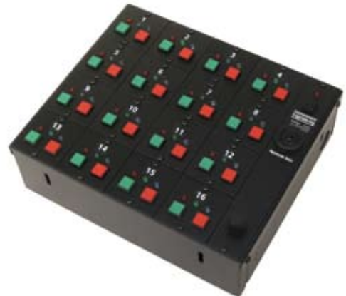
Remote Control/Status Indicator Box