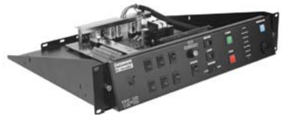
TA-10 Theatre Automation