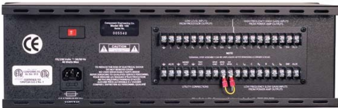
MS-100 Booth Monitor/Amplifier rear panel