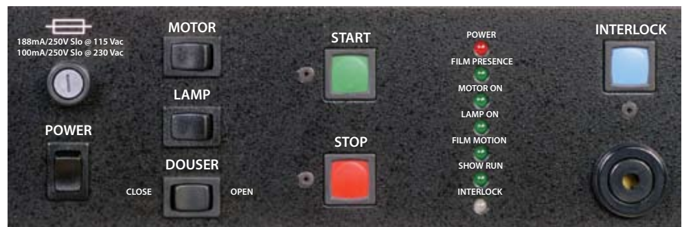
TA-10 front panel