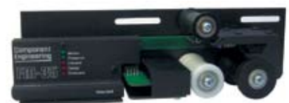
FM-35 Cue Detector