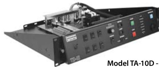
Model TA-10D - Drawer Mount