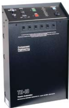
Model TA-10W - Wall Mount

Accessories and variations are available for many applications to fit your specific requirements.