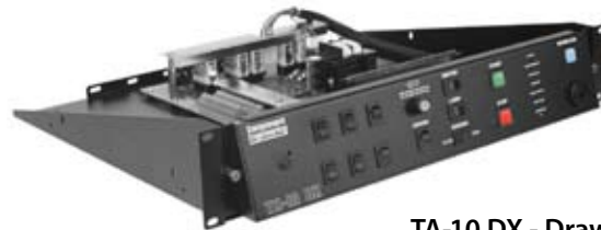
TA-10 DX - Drawer Mount