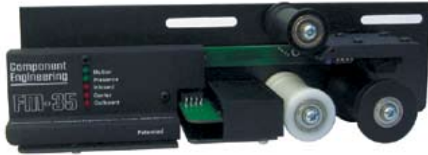
FM-35 Cue Detector

The TA-10 DX Theatre Automation is designed for use in conjunction with the FM-35 Cue Detector and Remote Control/Status Indicator Box. With the Remote Control/Status Indicator Box you can control and monitor up to 32 TA-10, TA-10 DX, and DA-10 automations.