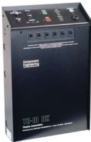
TA-10 DX - Wall Mount

Contains the familiar and full complement of relays required to control all of your house functions.